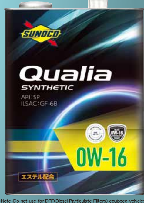
*Note: Do not use for DPF(Diesel Particulate Filters) equipped vehicles.