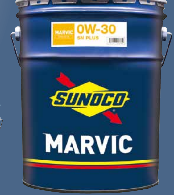
*Note:Do not use for DPF(Diesel Particulate Filters) equipped vehicles